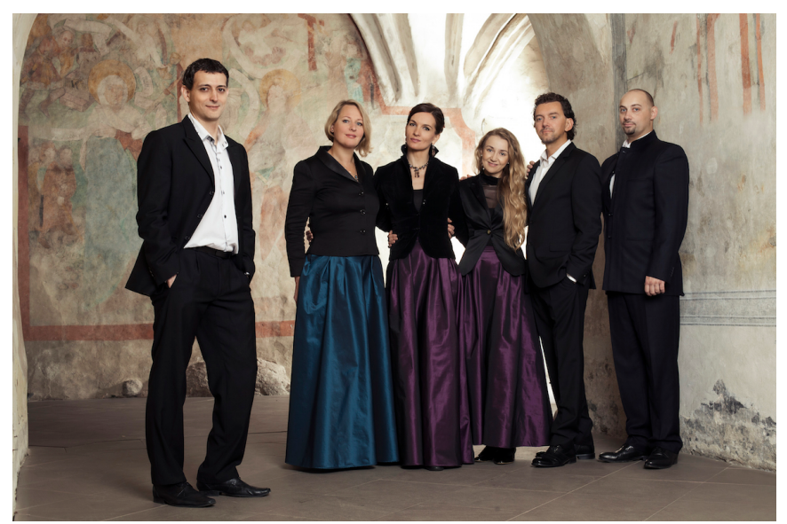
Canto Fiorito, Vilnius

In 2018 Lithuania is celebrating the 100 years anniversary of the Republic of Lithuania – its Act of Independence was signed on the 16<sup>th</sup> of February in 1918, declaring the founding of the modern state. We are very happy to present you the international artistic collaboration project, supported by the European Commission Programme Creative Europe , with its project leader the Lithuanian early music ensemble Canto Fiorito to be implemented in European countries during the course of 2018 – Lithuania's anniversary year. Canto Fiorito is a new phenomena in the state, which did not have the early music tradition before, thus it is a great possibility to present a Lithuanian early music ensemble in your country for the first time.